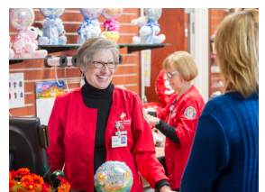
The Maple Corner Boutique & Gift Shoppe is staffed almost entirely by volunteers.