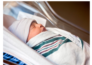
The Auxiliary donated $13,000 for newborn bassinets.

Volunteers are welcome to join the Auxiliary at any time. Membership dues are $5 a year, payable by check or cash in the Volunteer Office. Membership dues help fund general expenses, as well as future contributions of specialized items and equipment. Members of the Auxiliary also receive a discount on select merchandise in the Maple Corner Boutique & Gift Shoppe.