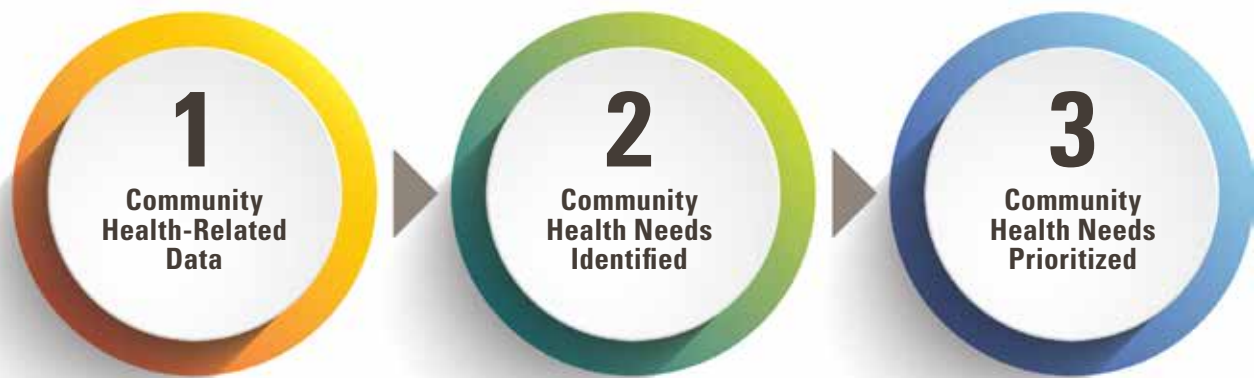
Figure 1: Data and the Prioritization of Community Health Needs

Based on findings of the 2018 CHNA report, Goshen Health will develop initiatives that focus on improving the health of those it serves.